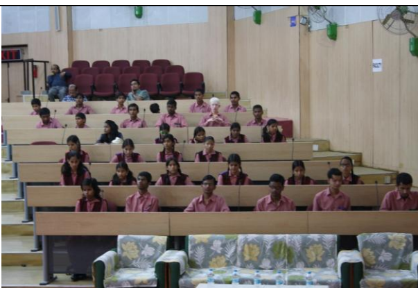
5. Students from NIVH