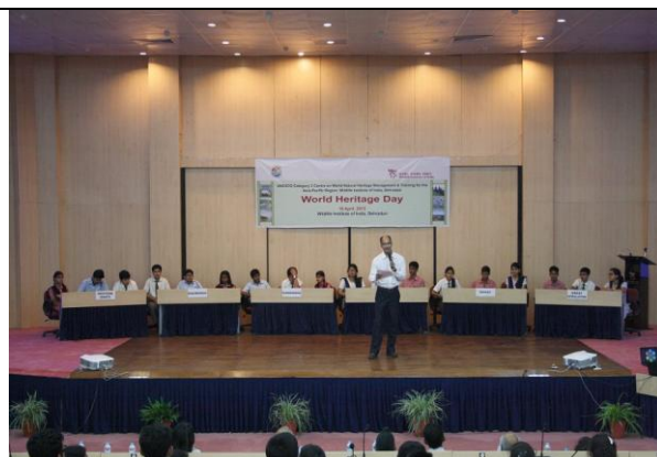
6. Participating teams in the Quiz