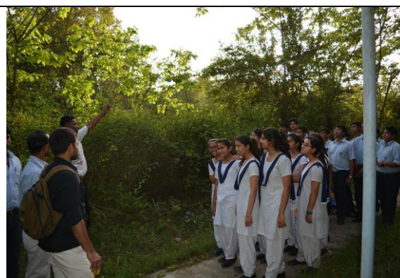
12. Students of The Asian School on Nature Trail, WII Campus