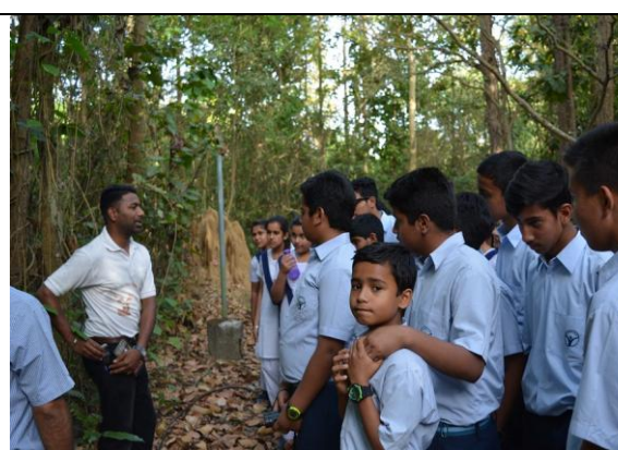
10. Young students learning about fauna on Natural Trail, WII Campus