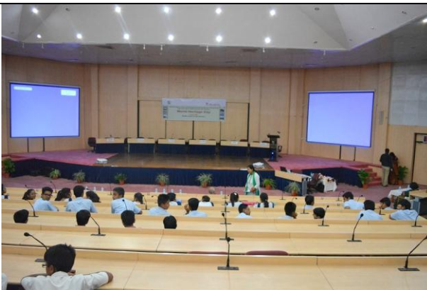
1. View of the auditorium