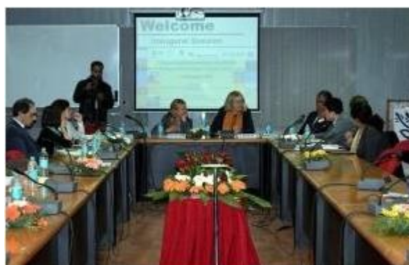
Picture 4. Discussion during Technical Session 1