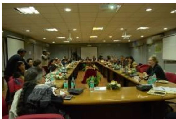
Picture 14. Discussion during Technical Session