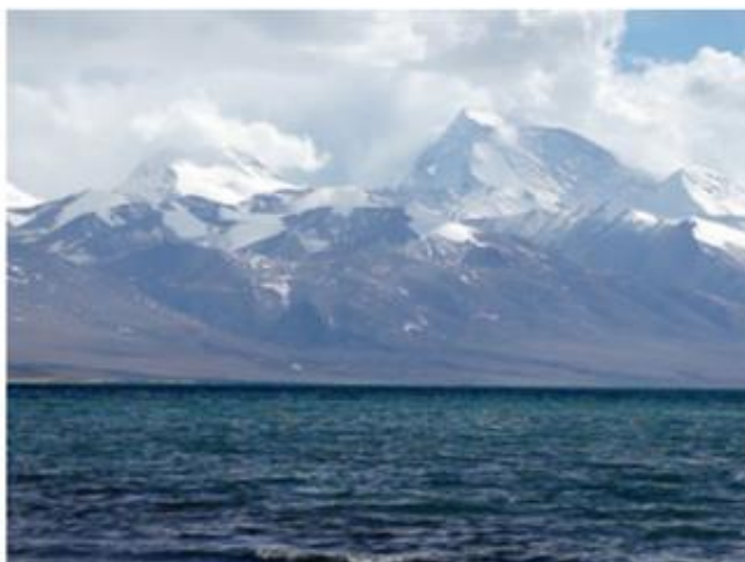
Kailash Mansarovar landscape.

Aptech trains you in the latest technologies – Java, .NET, app & web development. Apply!