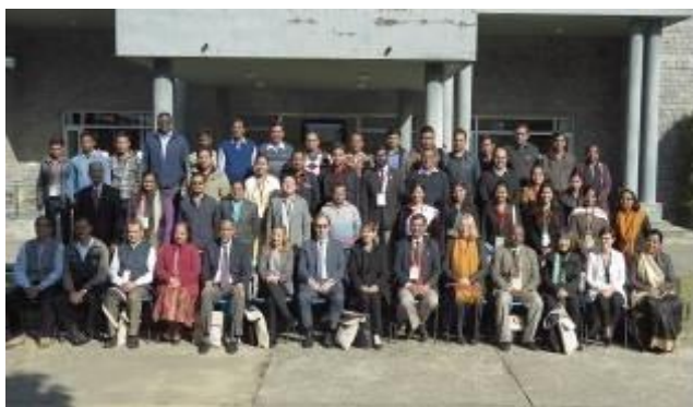
Picture 1. Group photograph of 5 th Annual Coordination Meeting of UNESCO Institutes and Centres related to World Heritage