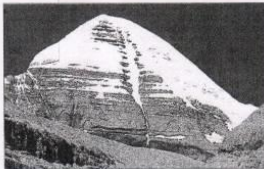
■ A view of Kailash Mansarovar. The Kailash Sacred Landscape Conservation and Development Initiative is a transboundary collaborative programme between China, India and Nepal

"The Kangchendzonga National Park in Sikkim has been inscribed as the first mixed