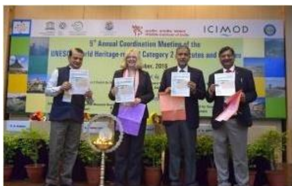
Picture 3. Launch of monsoon edition of Natural Heritage Bulletin by UNESCO Category 2 Centre – India