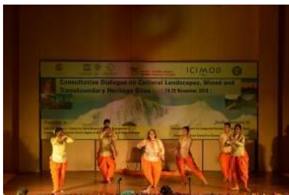
Picture 18. Cultural night performed by the students of D.A.V, Defense Colony, Dehradun