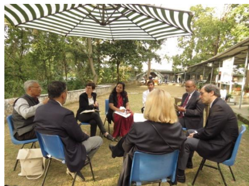
Picture 12. Group activity with participants of Kailash Sacred Landscape