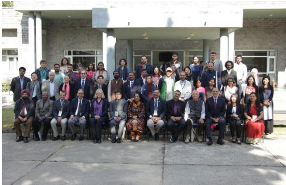
Picture 7. Group photo on Consultative Dialogue on Kailash Sacred Landscape