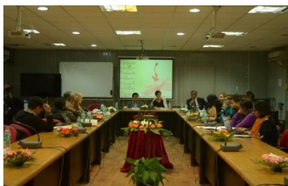
Picture 6. Discussion during Technical Session 2