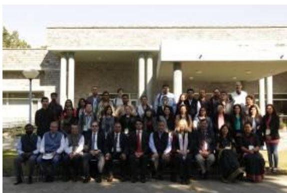
Picture 13. Group photo of Consultative Dialogue on cultural landscape, mixed and transboundary heritage sites