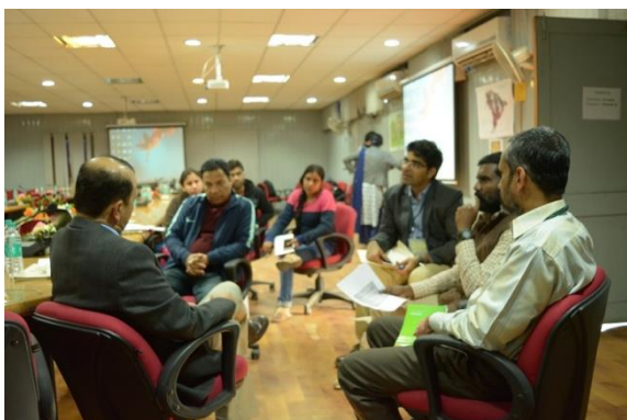
Picture 11. Group activity with participants of Kailash Sacred Landscape